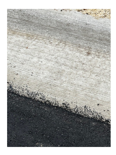
Asphalt against Curb and Gutter

Most of the aggregate materials we supply go to companies that produce asphalt and concrete. Two of such companies, Sioux Falls based Myrl & Roy's Paving and Ace Ready Mix, are within the L. G. Everist family. These companies pave roads, develop parking lots, and supply materials for housing developments as Sioux Falls and the surrounding areas continue to expand.