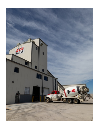
Ace Ready Mix - 9 Mile Park

Of course, all these projects also require base aggregate materials, pipe bedding for water and sewer installation, as well as specialty products such as a specific rock gradation used to backfill bridge wall abutments. Our five rock quarries, as well as our sand and gravel plants, work hard to produce a variety of materials that will be available for distribution to ensure projects can be completed in a timely manner.